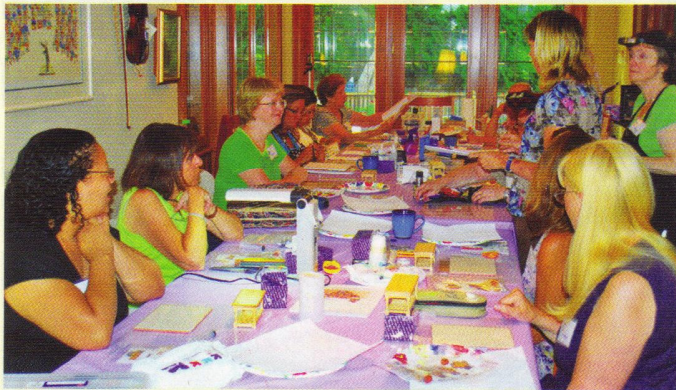
Above: The class listens attentively.